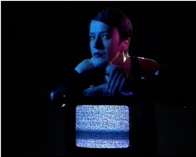
Gržinić & Šmid, Tri sestre (Three Sisters) , 1992. © Gržinić & Šmid.