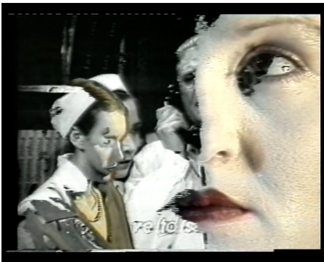
Gržinić & Šmid, Trenutki odločitve (Moments of Decision) , 1985. © Gržinić & Šmid.

Co-financed by the Minister of Culture and National Heritage from the Culture Promotion Fund – a state earmarked fund.